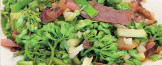
Stir-fried tuberose'sbud $210