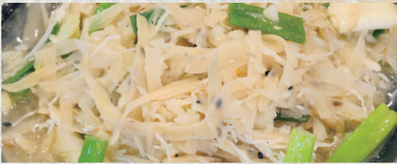
Stir-fried areca flower $190