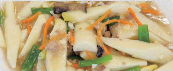
Stir-fried water bamboo shoot