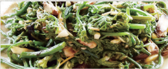
Stir-fried vegetable fern $190