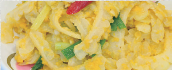
Sauteed bitter gourd with salted egg yolk $220