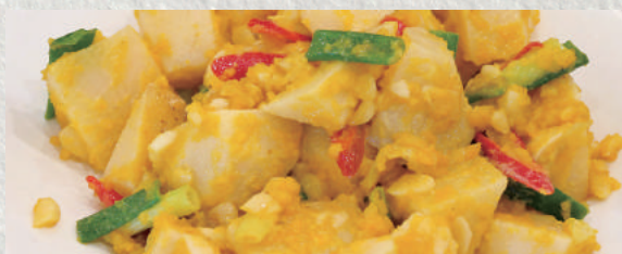
Sauteed oldham bamboo shoot with salted egg yolk