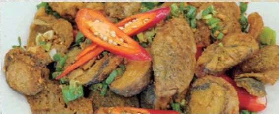
Garlic crisp preserved egg $220