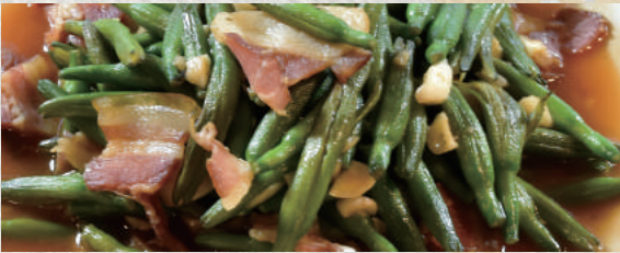
Stir-fried orange daylily