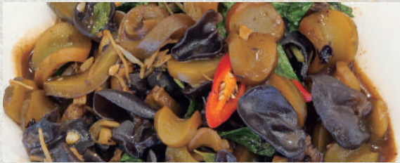
Three cups of bispirulina