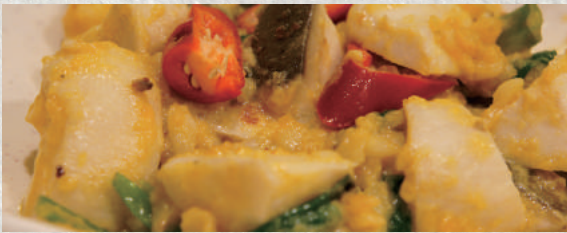
Sauteed king oyster mushroom with salted egg yolk $220