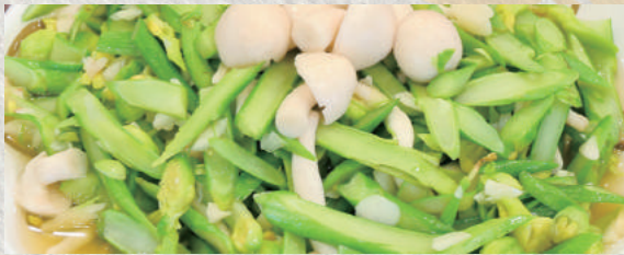
Stir-fried lily flower