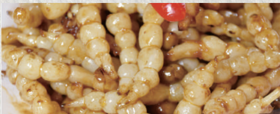
Stir-fried rhizome of ferns $210