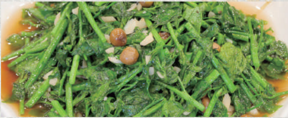
Stir-fried Plant buds from Vietnam $190