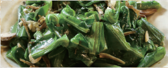
Stir-fried bird's nest fern $190