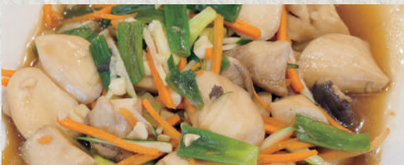
Sauteed king oyster mushroom with soy sauce $220