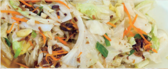
Stir-fried alpine cabbage $190