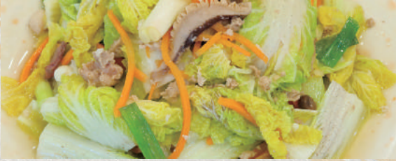
Stir-fried baby Cabbage