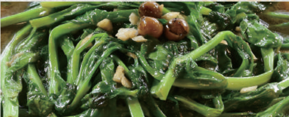
Stir-fried pea shoot