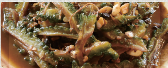
Stir-fried bitter gourd with black bean sauce $190