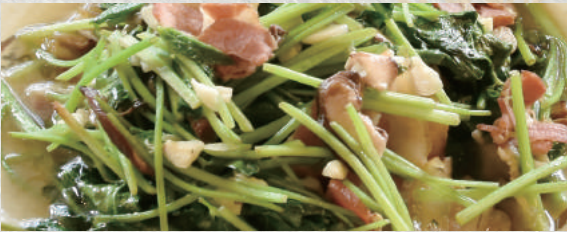
Stir-fried mountain celery