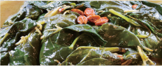
Stir-fried anredera cordifolia with sesame oil