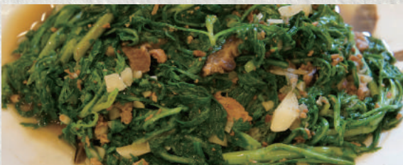
Stir-fried garland Chrysanthemum $190