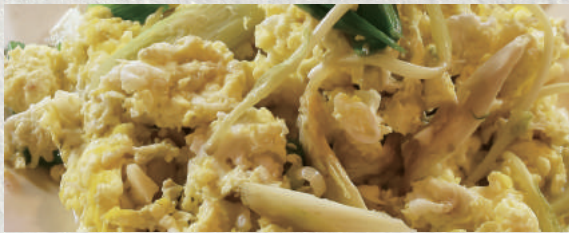
Stir fried eggs with ginger Lily