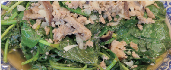
Stir-fried sweet potato leaves $190