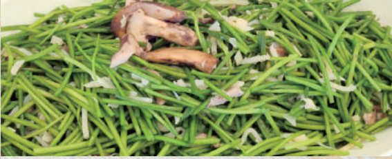
White water snowflake