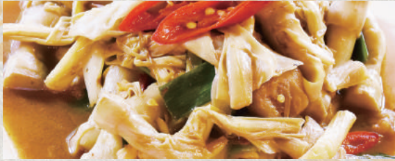
Sugar cane bamboo shoot