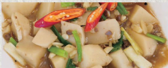
Sauteed oldham bamboo shoot with soy sauce